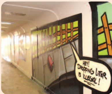
The subway in Washington

Washington Neighbourhood Policing Team, working with partners from Safer Sunderland, celebrated a community day by turning a subway into an art studio.