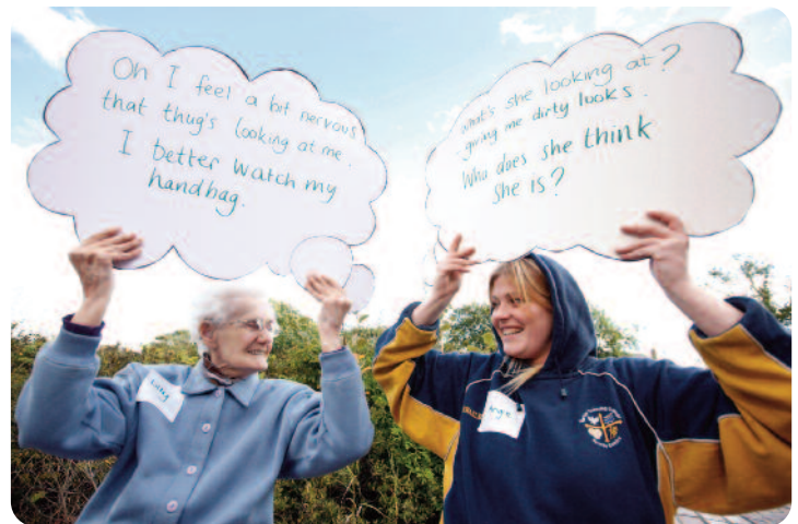
Members of Age UK South Tyneside's presenting team at this year's participatory budgeting event

Age UK South Tyneside will also be running the COAST project which will bring young and old people together in activities to reduce fear and anti-social behaviour.